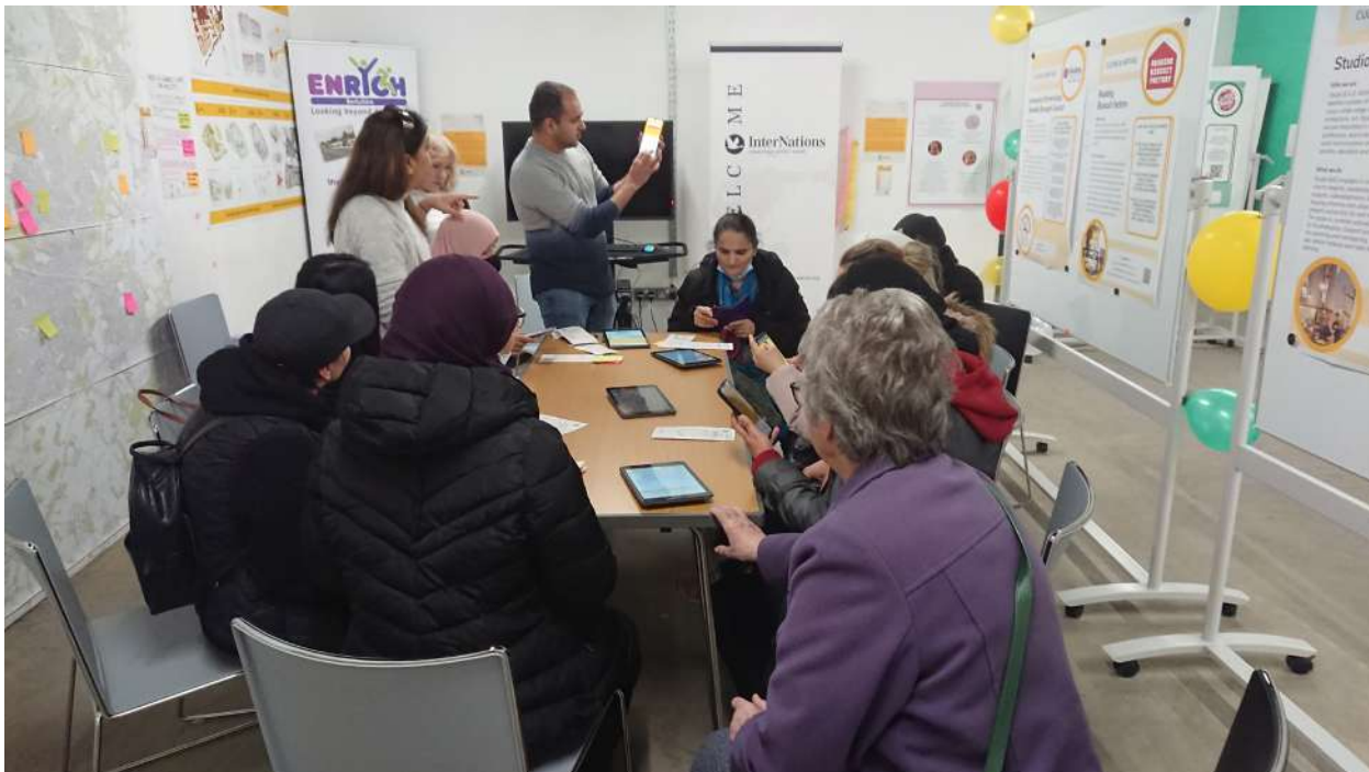
Your Place Our Place CQoL Urban Room Reading